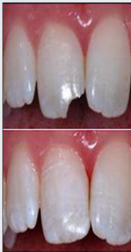
TREATMENT OF FRACTURED TOOTH