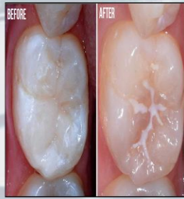
APPLICATION OF SEALANT TO PREVENT DECAY