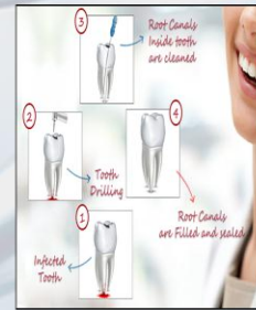
ROOT CANAL TREATMENT