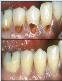
PROVIDE TOOTH COLOR REMEDIES FOR DECAYED TOOTH