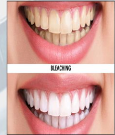
TEETH WHITENING SOLUTIONS